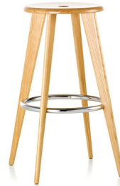
High Stool 7,00 EUR/Piece