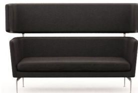
Lounge Sofa 42,00 EUR/Piece