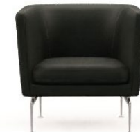
Lounge Armchair 35,00 EUR/Piece

> Package 1 70,00 EUR (1 standing table, 2 high stools, 1 table, 4 chairs)