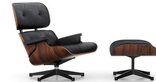
Lounge Chair 300,00 EUR/Piece