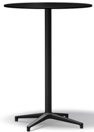
Bistro Standing Table 21,00 EUR/Piece