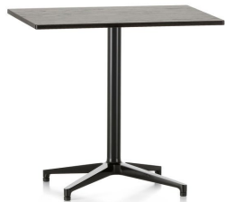
Bistro Table 21,00 EUR/Piece