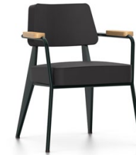
Fauteuil Armchair 56,00 EUR/Piece