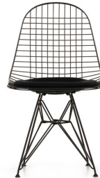
Chair 7,00 EUR/Piece